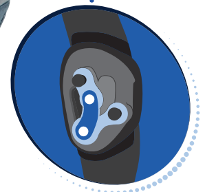
Exclusive Townsend Motion Hinge